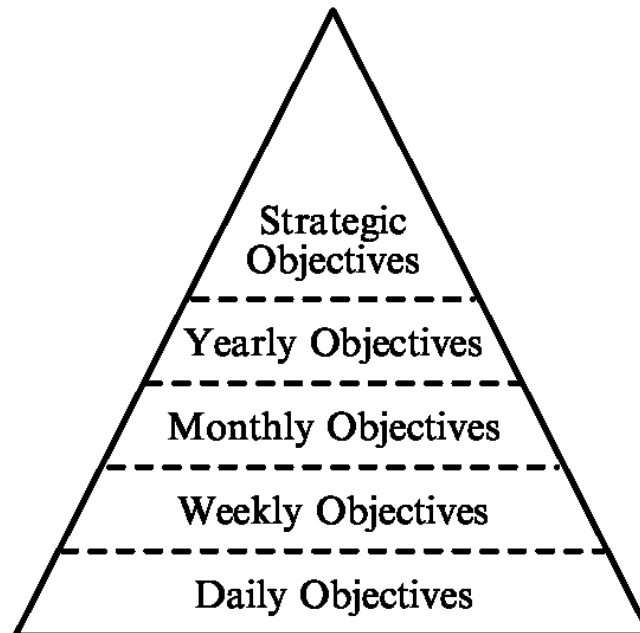
Figure (1): Pyramid of Objectives

Making a timetable for objectives is of great value when measuring efficiency and effectiveness of their achievement within the defined period. Activities within that period are to be arranged in accordance with priority of objectives or details so that objectives can be reached as scheduled.